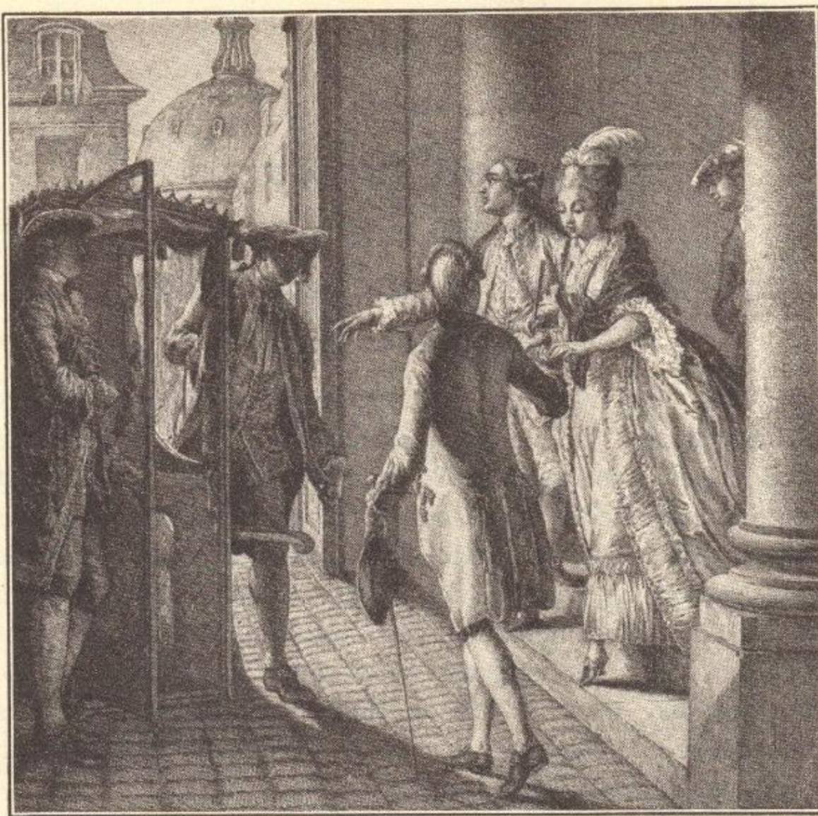
FRENCH LADY ENTERING A SEDAN CHAIR

The sedan chair, used by the upper classes during the seventeenth and eighteenth centuries, was carried by two "chairmen." It had side windows, a hinged door at the front, and a roof that opened to allow the occupant to stand. It took its name from the town of Sedan, France. This engraving, made in Paris in 1777, shows the elegant costumes worn by the nobility and their servants.