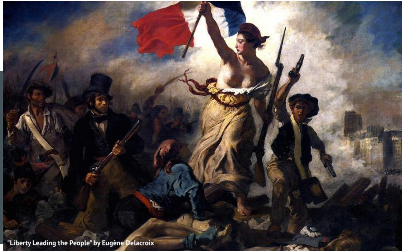
"Liberty Leading the People" by Eugène Delacroix